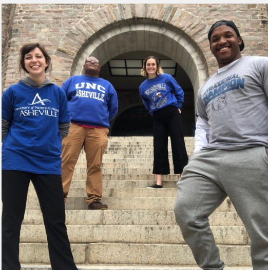
Our 4 UNCA Alumni staff! Go Bulldogs!

For the next two weeks, North Carolina colleges are waiving their application fees. As proud UNC Asheville alumni, we want to encourage all NC students interested to apply!